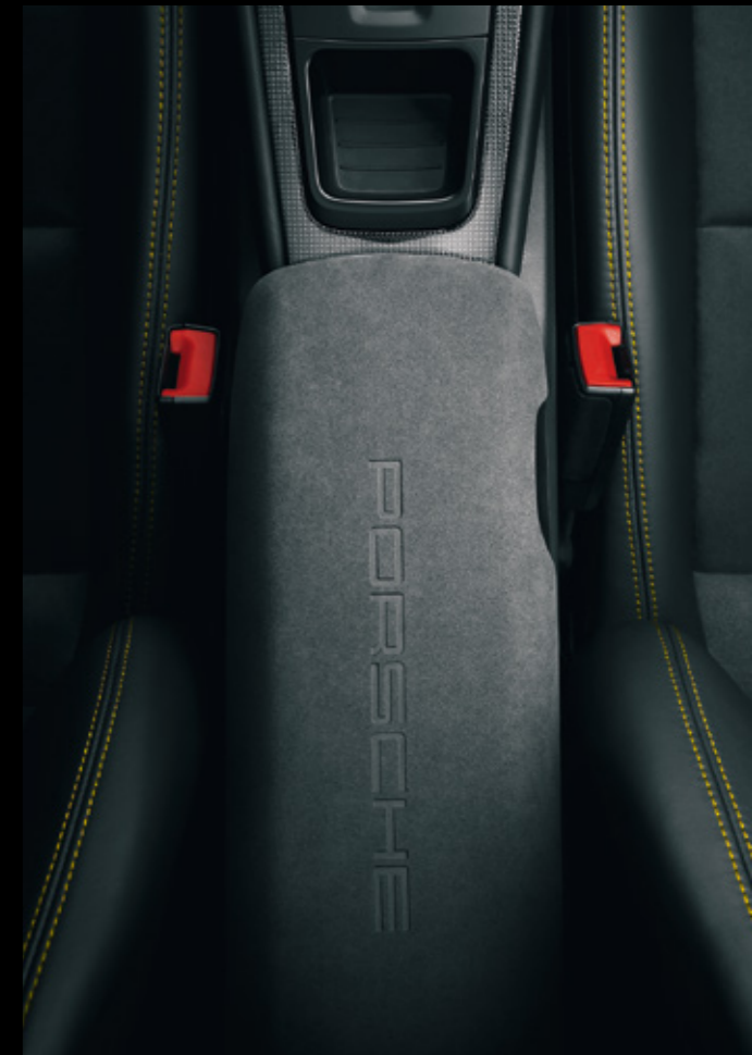
Storage compartment lid in Alcantara® with 'PORSCHE' logo, center console trim in carbon fiber

○ optional • standard equipment □ available at no extra cost