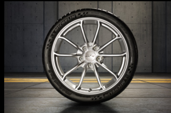
Cayman GT4 wheel painted in silver

The vehicles illustrated in the chapter on personalization may include additional options not featured in this catalog. For information on these options, please consult your authorized Porsche dealer. For more information on the options featured in this catalog, please refer to the separate price list.