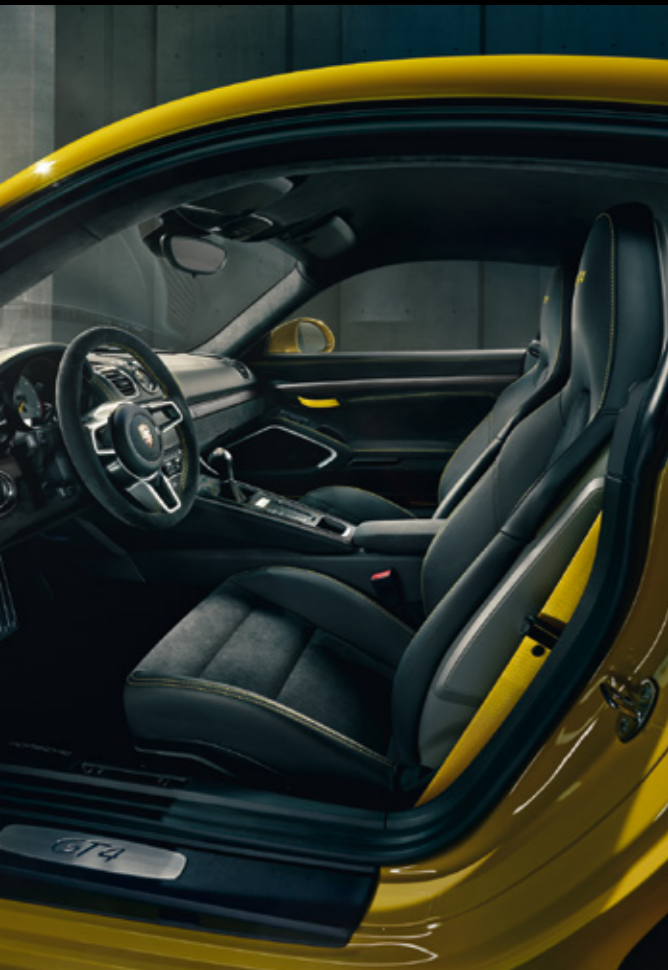
Anodized Black brushed aluminum interior package