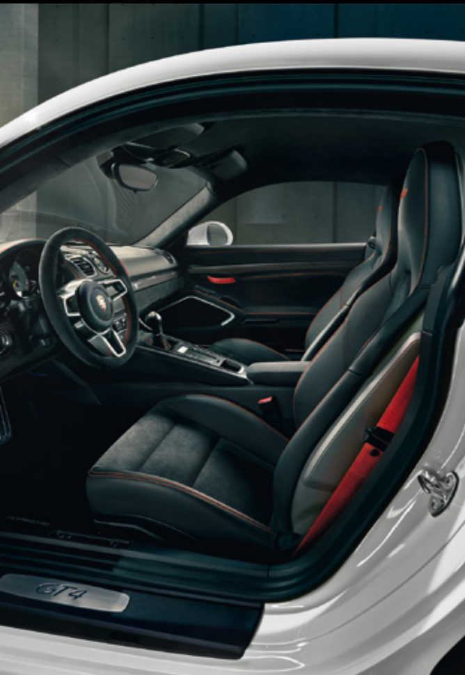
Leather interior with deviated stitching in red