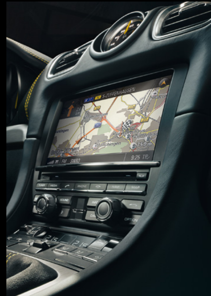
Porsche Communication Management (PCM) including navigation module

○ optional ● standard equipment □ available at no extra cost