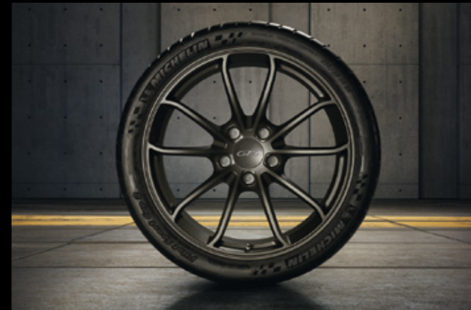
Cayman GT4 wheel painted in satin black