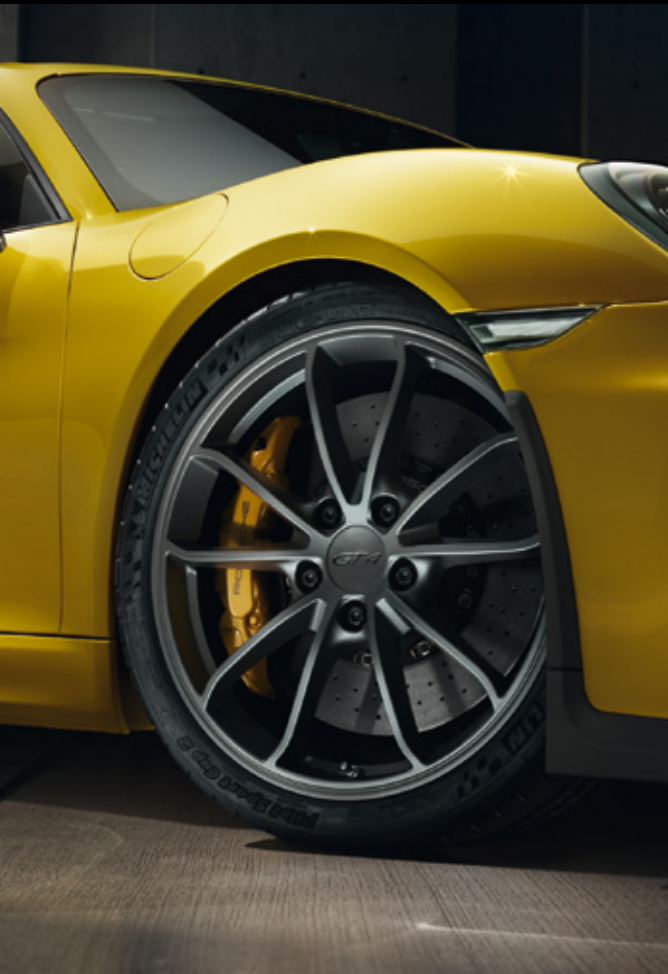
Porsche Ceramic Composite Brake (PCCB)