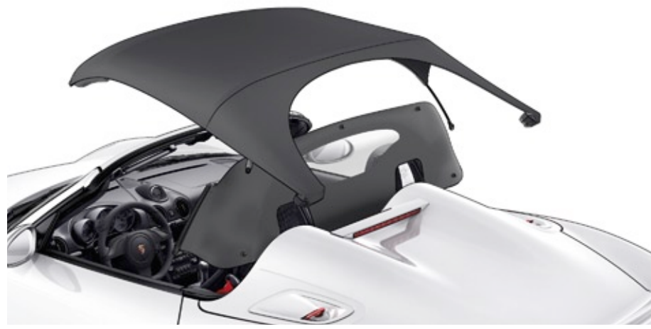
Sun shield and weather protector