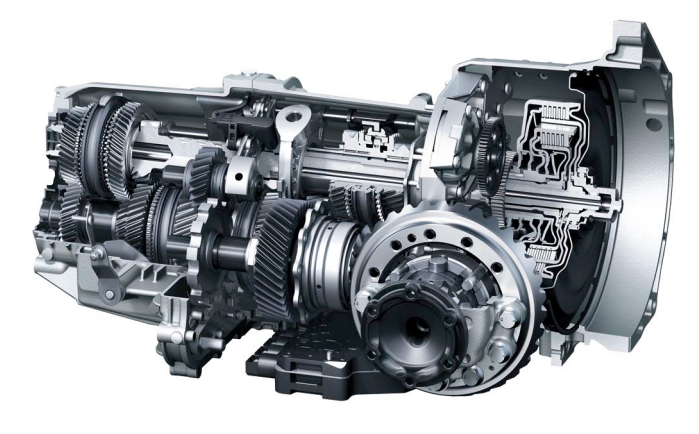
7-speed Porsche Doppelkupplung (PDK)

Power output and torque chart for the Boxster Spyder