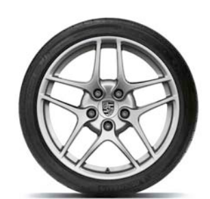
19-inch Carrera S II wheel