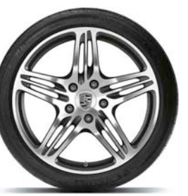
19-inch 911 Turbo wheel