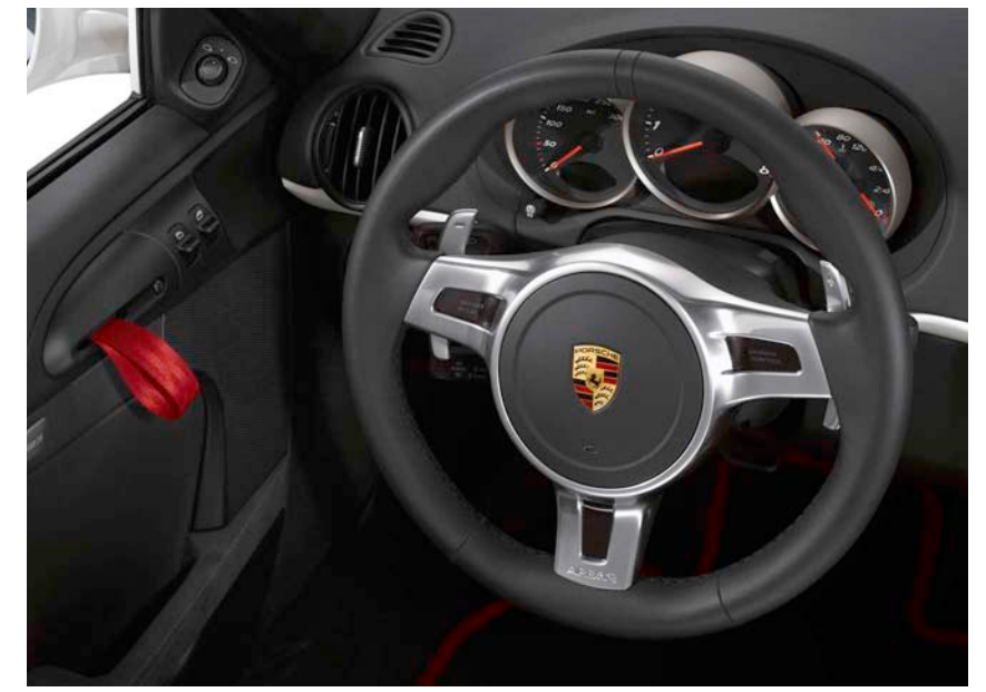
Three-spoke sports steering wheel with gearshift paddles