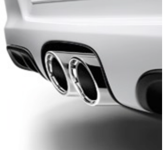
Sports exhaust system