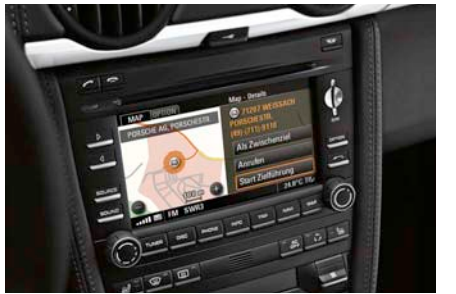
Porsche Communication Management (PCM) including navigation module