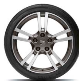
19-inch 911 Turbo II wheel