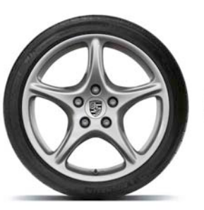
19-inch Carrera Classic wheel