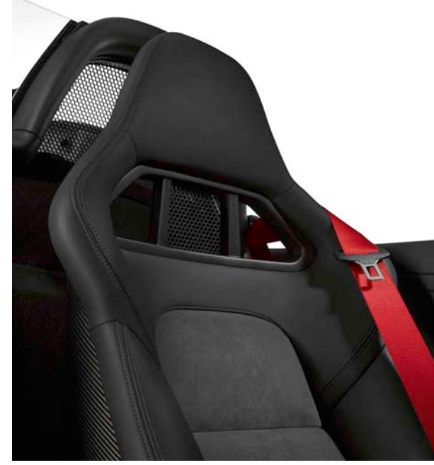
Sports bucket seat

purity of design. The dial faces of the circular instruments are finished in black. The removal of the instrument shroud provides another accent on the theme of