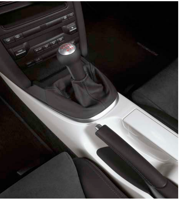
Centre console and six-speed gear lever