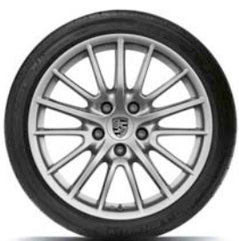
19-inch SportDesign wheel