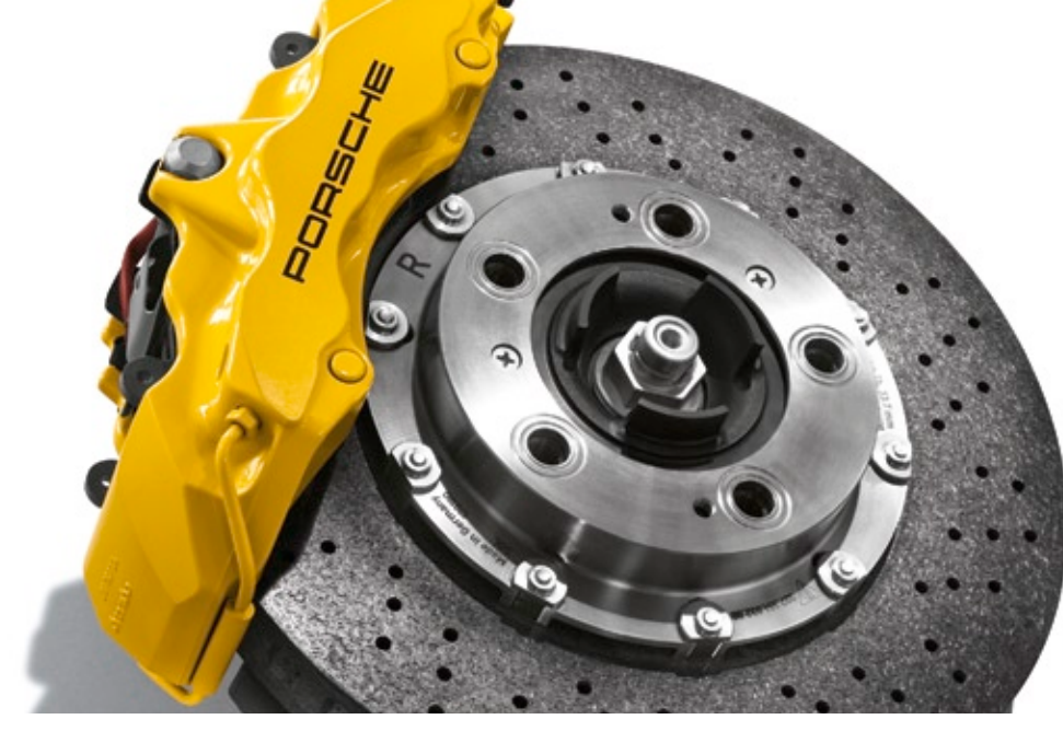
Porsche Ceramic Composite Brake (PCCB)

Sportiness without the 'ifs' and 'buts'. Even the wheels abide by this ideology. The Boxster Spyder is equipped as standard with specially developed 19-inch wheels. To be more precise,