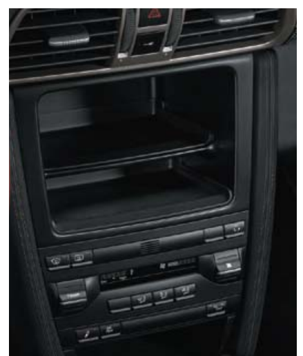
Deletion of air conditioning, audio system