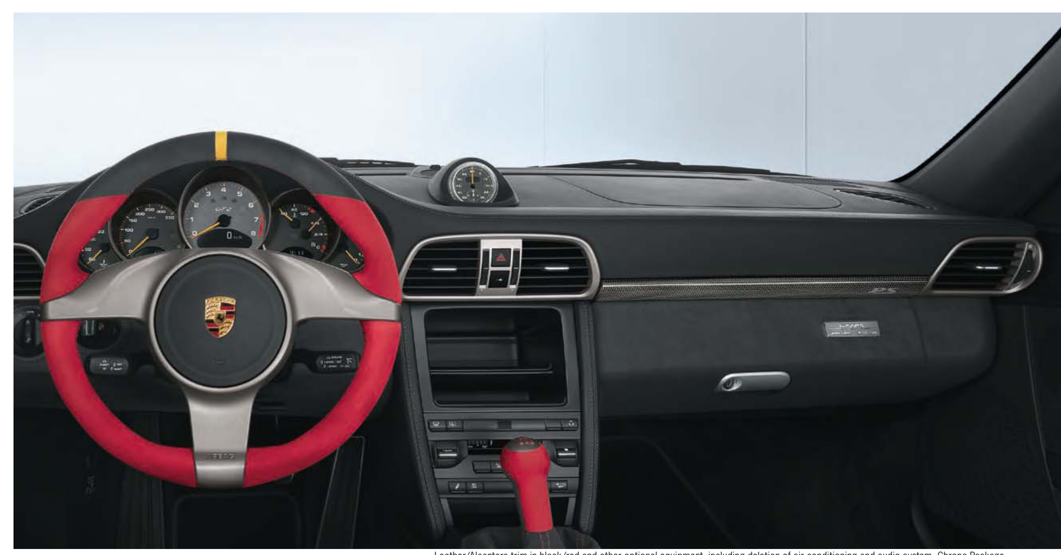
Leather/Alcantara trim in black/red and other optional equipment, including deletion of air conditioning and audio system, Chrono Package