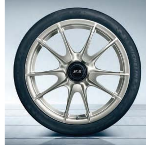
19-inch GT2 RS wheel

The dimensions: on the front axle 9 J x 19 with sports tyres<sup>1)</sup> 245/35 ZR 19 and on the rear axle 12 J x 19 with sports tyres<sup>1)</sup> 325/30 ZR 19. Tyre Pressure Monitoring (TPM) comes as standard and provides early warning of any tyre pressure loss via a display on the on-board computer.