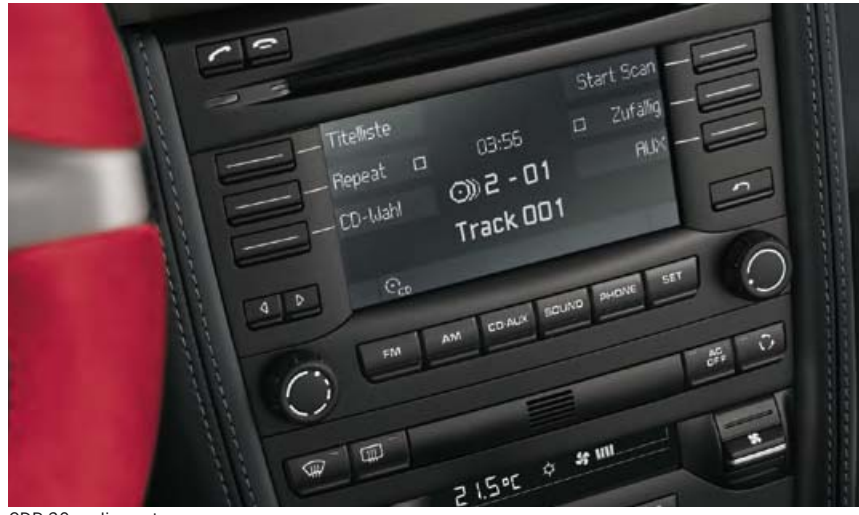
CDR-30 audio system