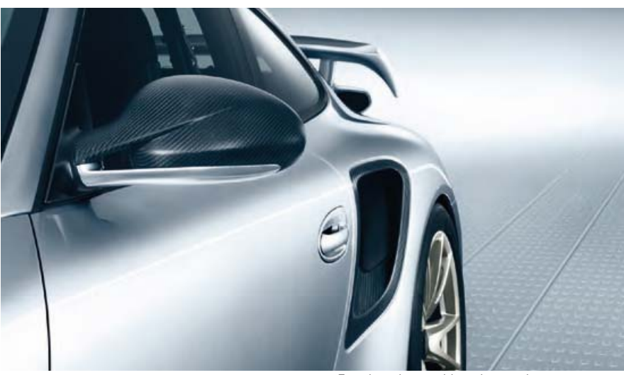
Exterior mirrors with carbon casing