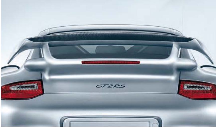
Rear middle section and rear wing lip in carbon