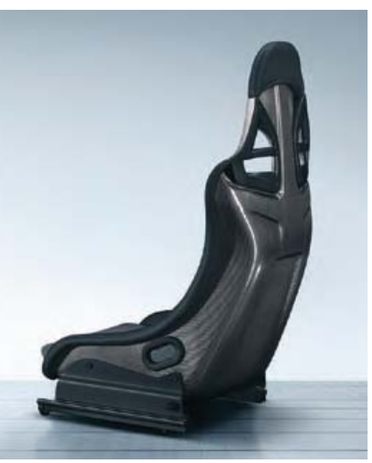
Lightweight bucket seats