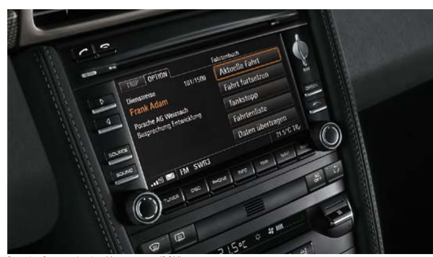
Porsche Communication Management (PCM)