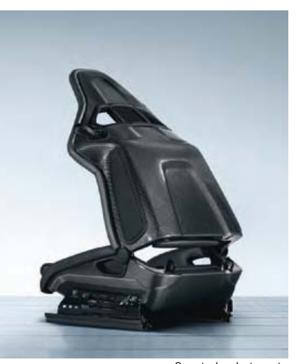
Sports bucket seats