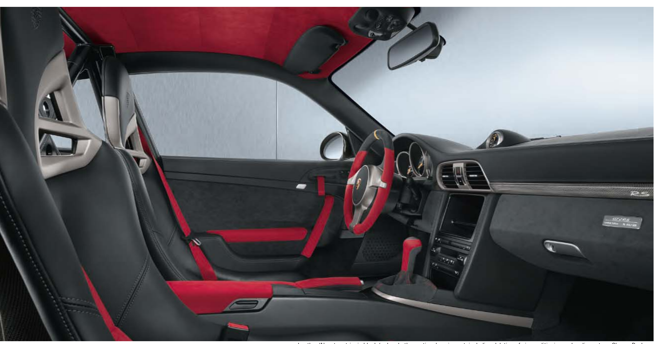
Leather/Alcantara trim in black/red and other optional equipment, including deletion of air conditioning and audio system, Chrono Package