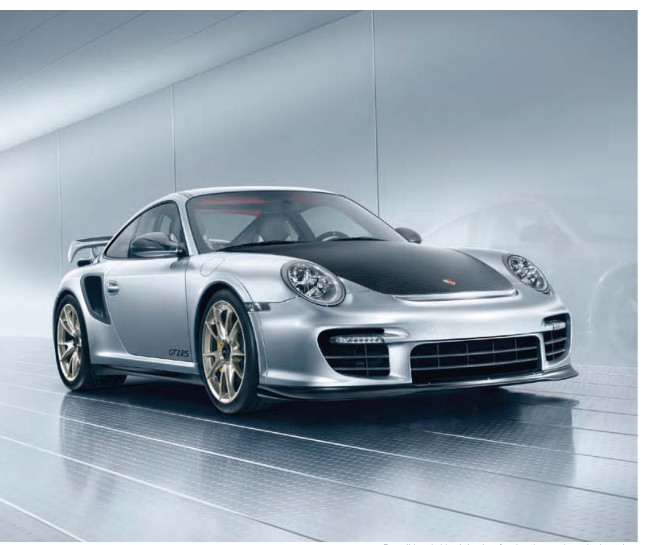
Front lid and side air intakes for the charge air cooler in carbon