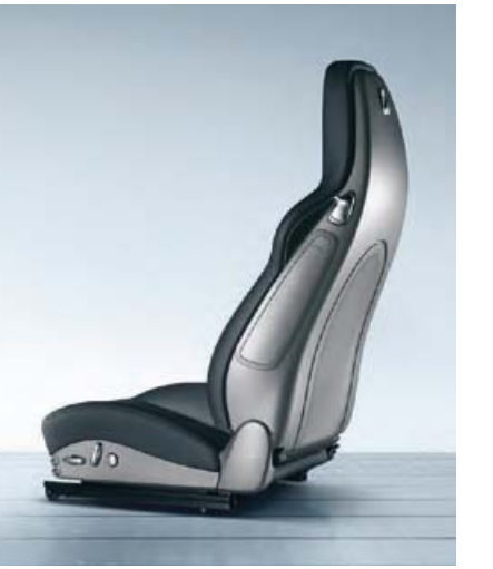
Adaptive sports seats