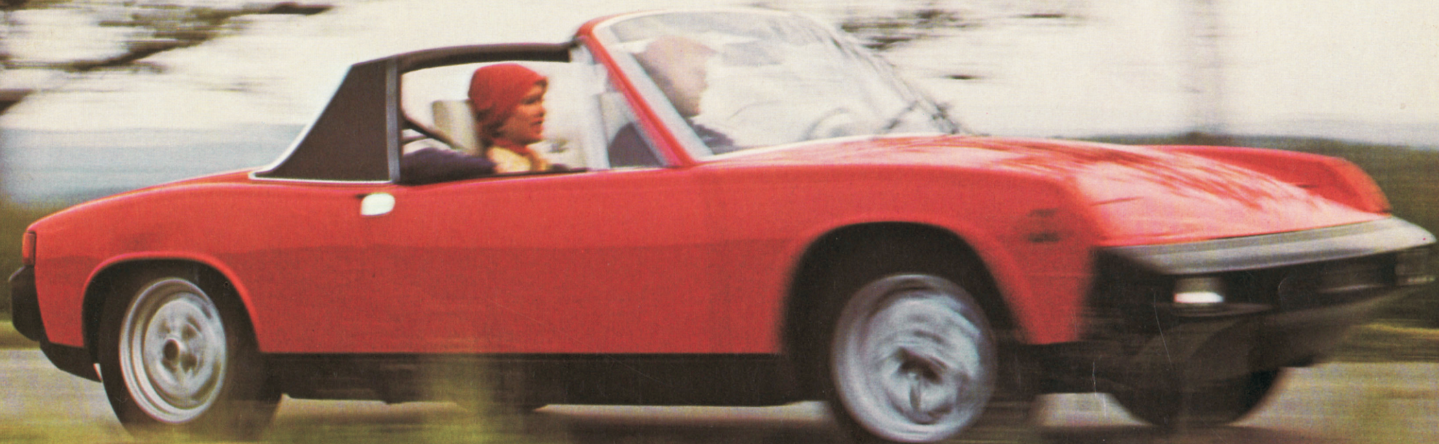
The Porsche 914/1975